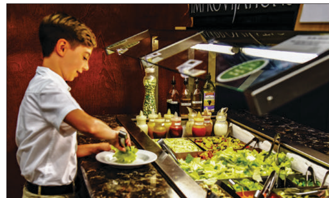
Daily meals are cooked from scratch for a unique dining experience.