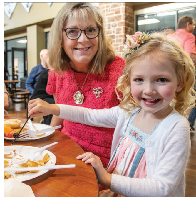
There are many opportunities for grandparent involvement.

Visit www.libertychristian.com/give to learn more. Every gift makes a difference!