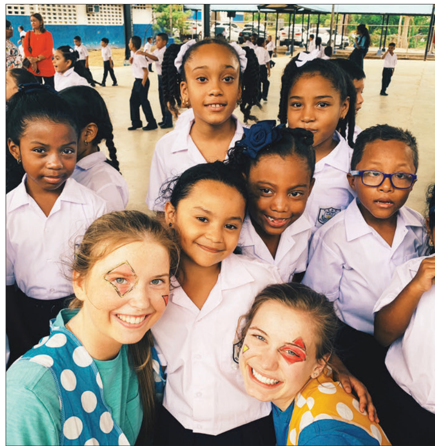
For more than 20 years, Liberty Christian Upper School students, faculty, and staff have spent Spring Break sharing the gospel abroad.