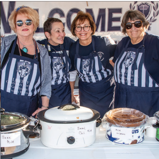
Chili Cook-off: Provides food, fun, and fellowship