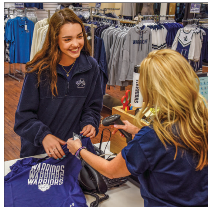
Purchase uniform, spirit wear apparel, and more at our campus store, Liberty Locker.

The safety of our students, staff, and visitors is a top priority. We are thankful to have a full suite of campus safety monitoring tools including fobbed key access on external doors, blue light intruder notification and alert system, and campus surveillance